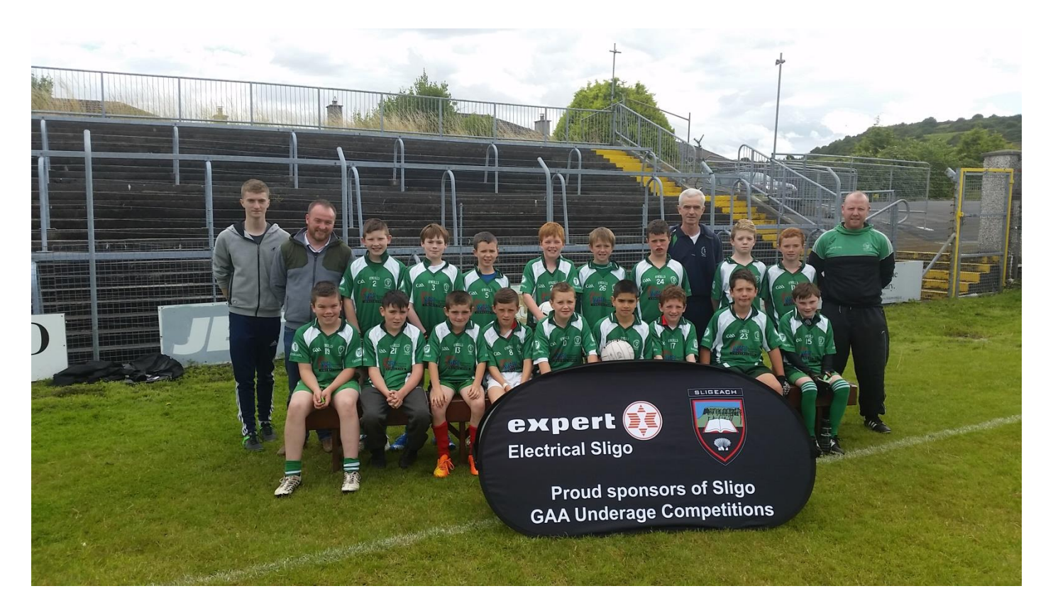
Under 12 Boys in Markievicz Park