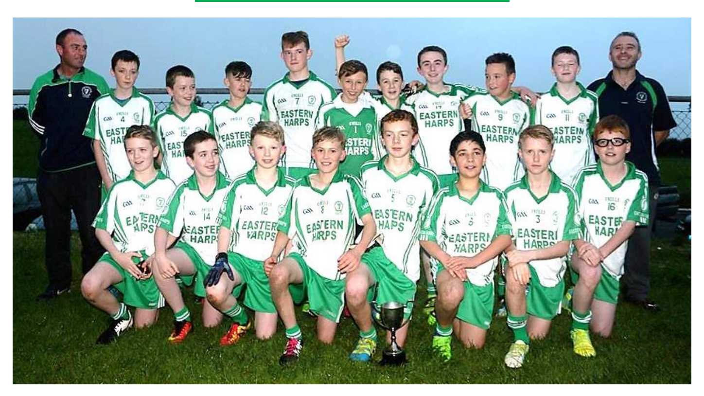
Our U16 Double-Double winning Captains 2015 & 2016