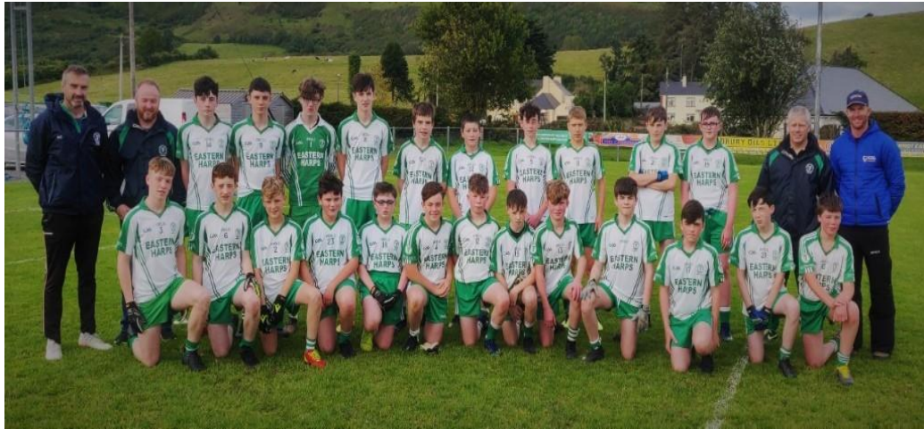
U 14 Boys 2020