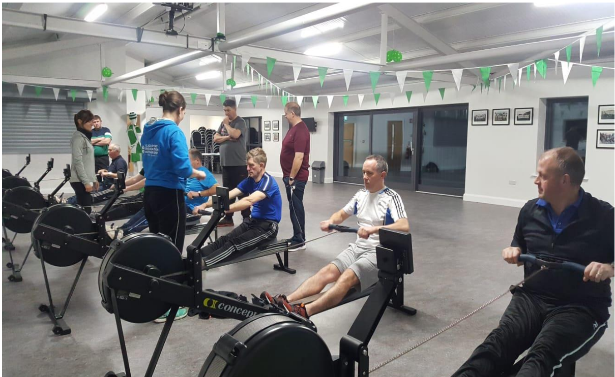
Mens Rowing 2020