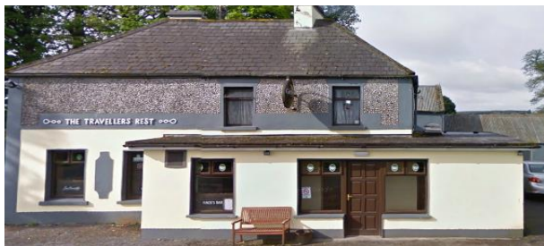
The Traveller's Rest